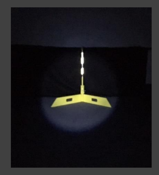
Reflective Markers make the units visible at night